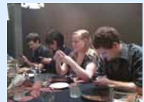
Having dinner out with your friends.