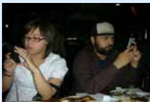
Out on an intimate date