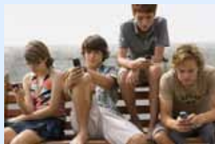
A day at the beach.