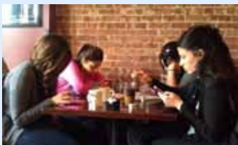
Having coffee with friends.