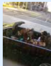
Enjoying the sights