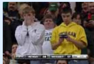
Cheering on your team.