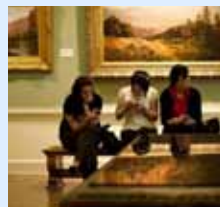
A visit to the museum